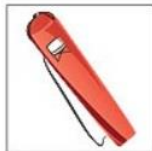
Folding Chair Bag (Folding Chair is Allowed)