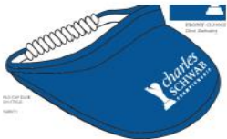
Volunteer WOMEN Visor