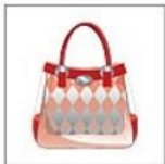
Printed Pattern Plastic Bag