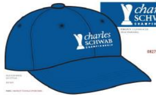
Volunteer Baseball Hat