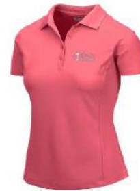
Volunteer WOMEN Polo