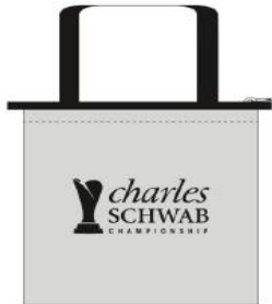
Volunteer Clear Tote