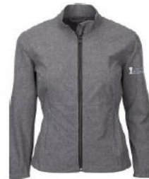
Volunteer WOMEN Jacket