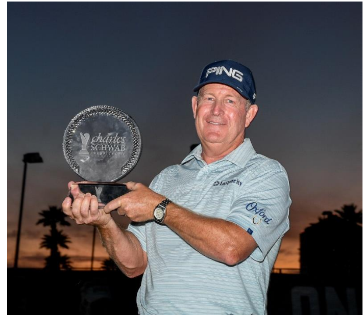
JEFF MAGGERT 2019 Charles Schwab Cup Championship Champion