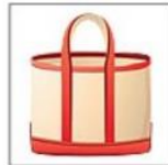
Over-sized Tote Bag