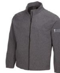
Volunteer MEN Jacket

*BOTTOMS: MUST BE KHAKI PANTS, SHORTS, SKORTS (all week)*