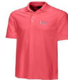
Volunteer MEN Polo