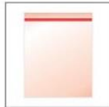
Tinted Plastic Bag