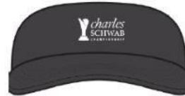
Volunteer Unisex Visor