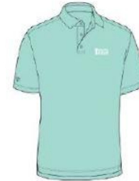
S - 3XL Seafoam