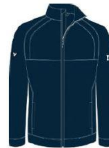
Volunteer MEN Jacket