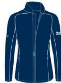
Volunteer WOMEN Jacket