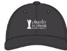
Volunteer Baseball Hat