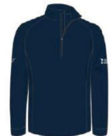
Volunteer MEN Jacket - 1/4 Zip 4XL