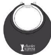
Volunteer WOMEN Visor