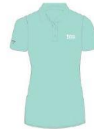
Volunteer WOMEN Polo