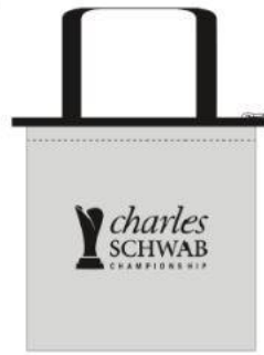
Volunteer Clear Tote