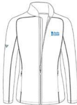
Volunteer WOMEN Jacket