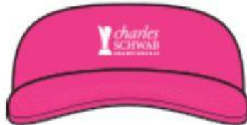
Volunteer Unisex Visor