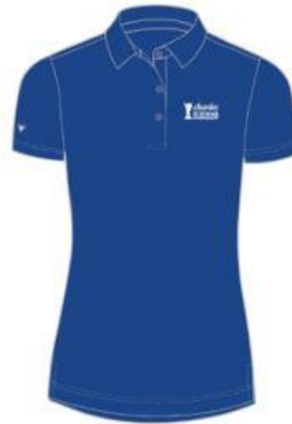
Volunteer WOMEN Polo