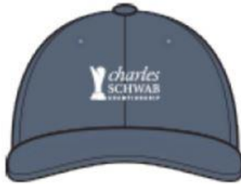
Volunteer Baseball Hat