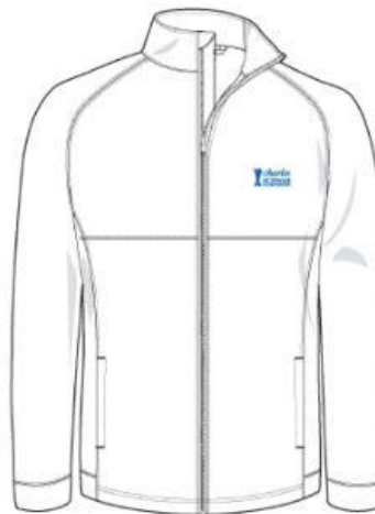
Volunteer MEN Jacket