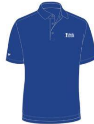
Volunteer MEN Polo