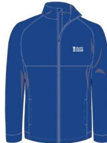
Volunteer MEN Jacket – 3XL